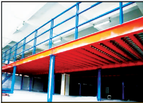
I BEAM MEZZANINE