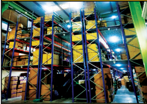
TWO TIER MEZZANINE FLOOR