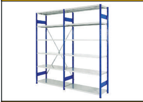
BOLT FREE RACKING