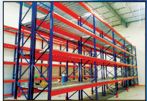
HEAVY DUTY RACKING