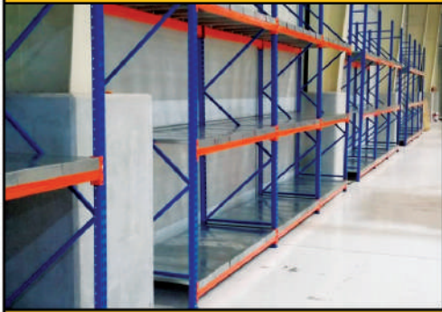
MEDIUM DUTY RACKING