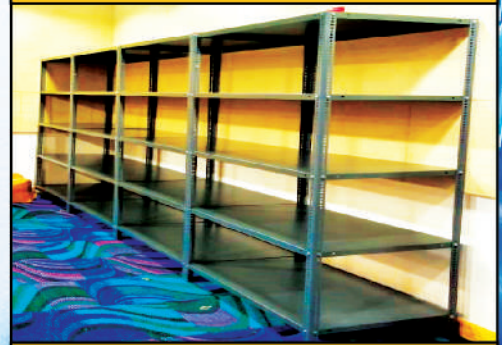
SOTTED ANGEL RACKS